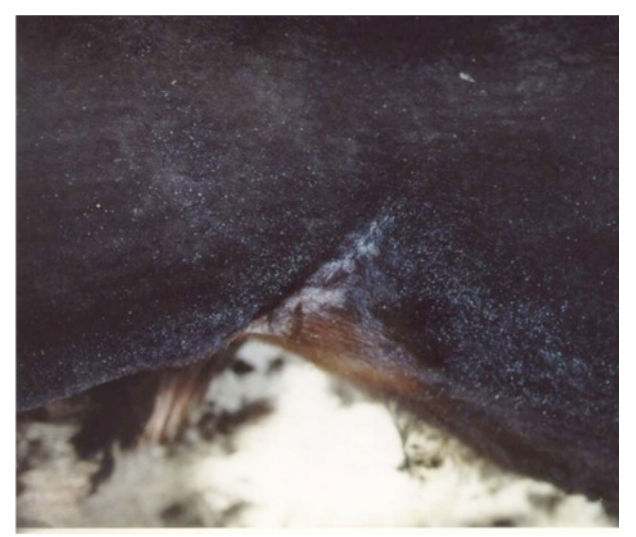
Figure 2. Lice eggs are most easily seen in the flank area and on the lateral thorax behind the elbow of brown and black alpacas at shearing time.

Biting lice are found at the base of hair shafts, close to or on the surface of the skin. On alpacas they may be found on any part of the body but are more common around the base of the tail, along the sides of the thorax and abdomen, on the upper part of the limbs, and in the flank. Shearers tend to initially find lice and their white eggs, particularly in brown and black animals, when shearing around the flank and lateral thorax behind the elbow (Figure 2).