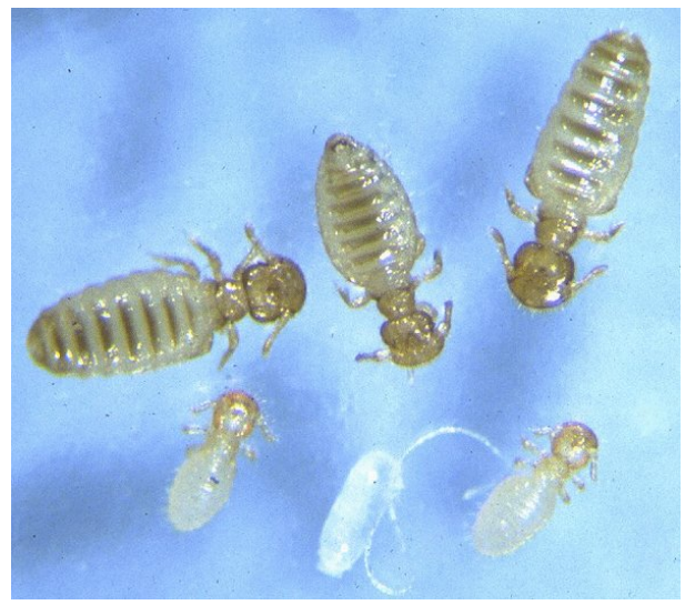
Figure 1. Bovicola spp lice (source: www.agric.wa.gov.au).

There are two genuses of camelid lice, namely the biting or chewing louse, Bovicola spp. (Figure 1), and the sucking louse, Microthoracius spp. The former genus of lice feed superficially on the skin, the latter penetrate the skin and feed on tissue fluids. The former genus was brought into Australia on imported alpacas, the latter species was eradicated prior to importation as injectable parasitacides were administered in pre-export guarantine thus removing Microthoracius spp., however topical parasitacides were not administered, thus allowing entry of Bovicola spp. into Australia. Bovicola breviceps was first diagnosed in South Australia in 1996 (I Carmichael, personal communication) and has subsequently been diagnosed in camelids in Western Australia, Victoria, New South Wales, Queensland and Tasmania.