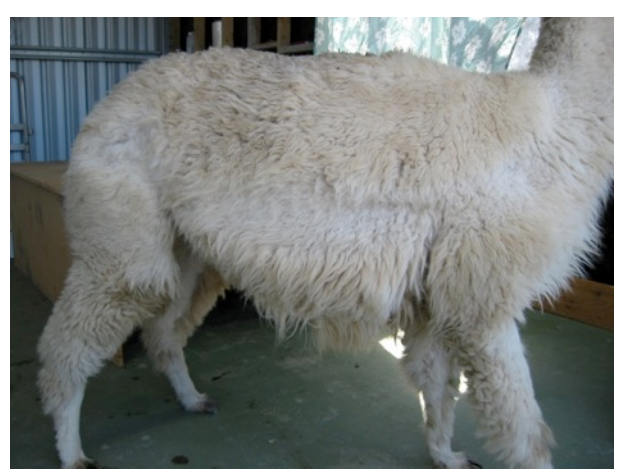
Figure 5. Australian alpaca showing areas of damaged fleece secondary to self-mutilation from lice infestation.

In most animal hosts, heavy infestations of biting lice cause irritation, which leads to rubbing and scratching. In sheep and goats this can lead to severe fleece derangement with loss in fleece value. Fowler (2010) reports that in heavy infestations in llamas the coat lacks lustre and has a ragged appearance and the animal may bite and rub itself. This has been observed in some but not all alpacas infested with biting lice in Australia (Figure 5). Some heavily infested alpacas have been detected only at shearing and had given no indication through extra rolling, rubbing or scratching that they were irritated by the infestation. Furthermore, obvious detrimental effects were not present in the fleeces of these infested animals.